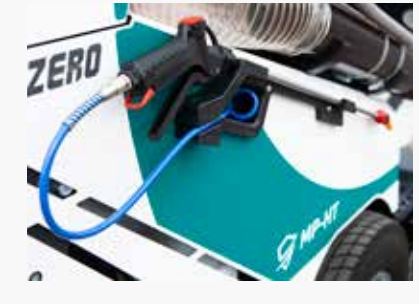
LOW-PRESSURE WASHING LANCE

To disinfect and sanitize. It is useful to clean the sweeper.